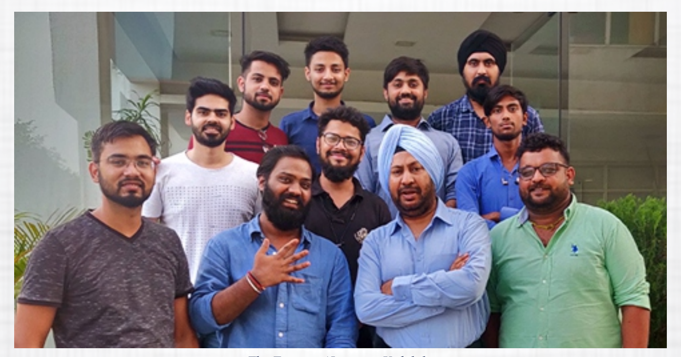
The Team at AI startup Vedalabs

Vedalabs, an AI startup that helps retail stores, has raised its preSeries A round from end-to-end retail store solutions provider Satin Neo Dimension, to expand its reach in retail analytics.